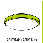
SANVI LED + SANVI RING