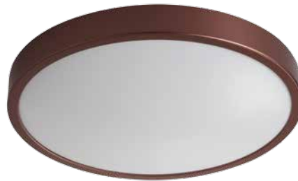
SANVI LED + SANVI RING